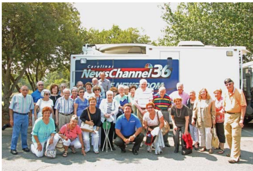
On September 1st the Temple Israel Social Club had a trip to WCNCTV Channel 36. The was one of the most enjoyable and informative outings we have had. Afterward we had lunch. You always get more bang for your buck at a TI Social Club event.